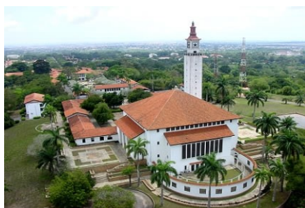
University of Ghana

MIASA's programmes are funded by the German Federal Ministry of Education and Research , while its local staffing, administrative and operational costs are borne by the University of Ghana.